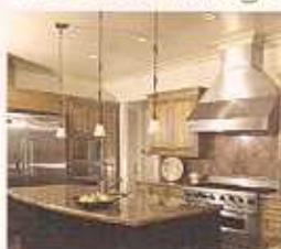
A Woodenbridge project

Woodenbridge is a full design and manufacturing facility. They have thousands of design options and combinations available. If you can dream it, Woodenbridge can build it. Cabinetry is designed specifically to meet each customer's requirements and a photo-realistic 3-D rendering will be shown for approval before any construction begins. All cabinetry is handcrafted in-house—absolutely nothing is subcontracted—and every cabinet is built with hand-selected lumber with no nails in the front facing frames.