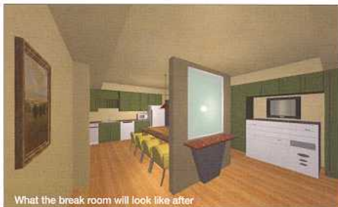
What the break room will look like after

Gentry will bring you the dramatic Before & After photos of this project just as soon as it is complete! ■