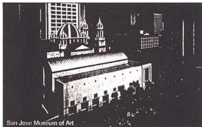
San Jose Museum of Art