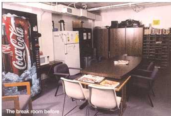
The break room before

Miller/Dolezal Design Group has partnered with Gentry Magazine on a community service project to benefit the San Jose Museum of Art